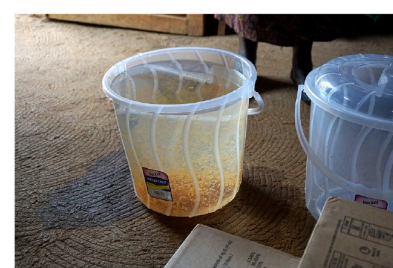
Wait another five minutes for the contents to settle.