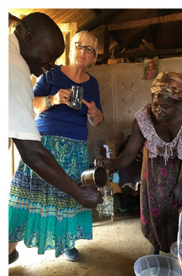
The clean purified water is now ready to drink.