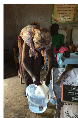
Carefully remove the filtering cloth with the sediment. Properly dispose of the sediment. Let water sit for 20 minutes.