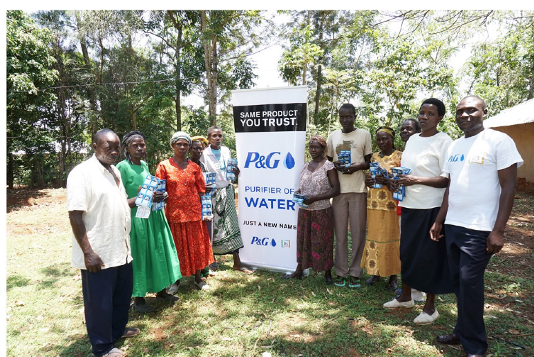
SVH-Ugunja support group

Each month SOTENI provides over 1550 vulnerable people with P&G sachets to purify their drinking water. Indirectly over 7750 people are provided with clean drinking water. SOTENI was able to provide 7,329,990 liters of clean drinking water during the 2016-17 year.