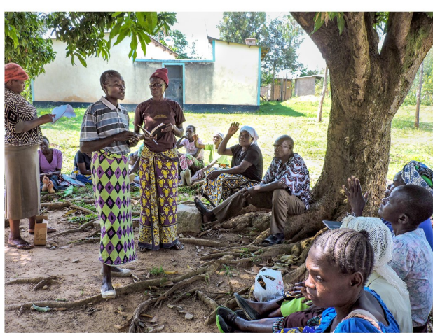
SVH-Ugunja Ligega support group

SVH-Mbakalo dispensary has served 2933 patients, ran 2655 lab test, tested 788 clients for HIV. SVH-Ugunja provided 1754 women with HIV counseling and testing and 709 were provided family planning services.