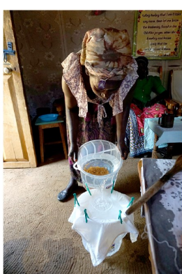
Slowly pour the water through the filtering cloth into a clean bucket.