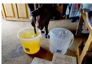
After adding the contents of the sachet, stir the water rapidly for five minutes.