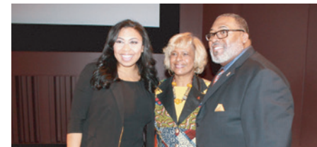
SOTENI welcomed Amb. Pamela Bridgewater to the Freedom Center in March.